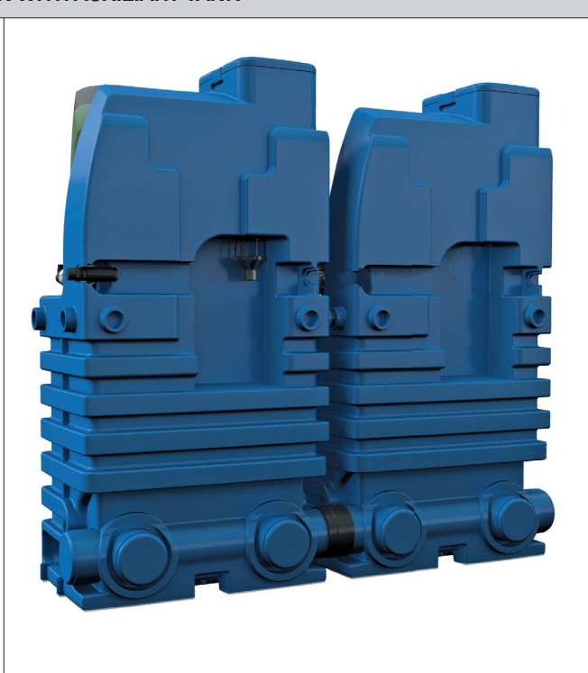
1xA + 1xB + 1xC + 1xD*

*FOR CONFIGURATION 2 REQUIRED ITEMS ARE: 1 E.SYBOX + 1 E.SYTANK + 1 E.SYTANK AUXILIARY CITERN + 1 E.SYTANK TANK COUPLING KIT