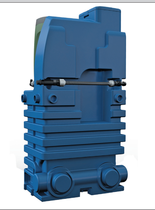
1xA + 1xB + 1xE*

*FOR CONFIGURATION 3 REQUIRED ITEMS ARE: 1 E.SYBOX + 1 E.SYTANK + 1 X E.SYTANK OPTIONAL DELIVERY KIT