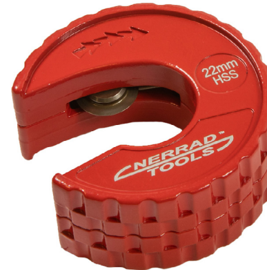
➤ NT2022PS PRO-SLICE COPPER TUBE CUTTER 22MM