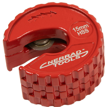
➤ NT2015PS PRO-SLICE COPPER TUBE CUTTER 15MM